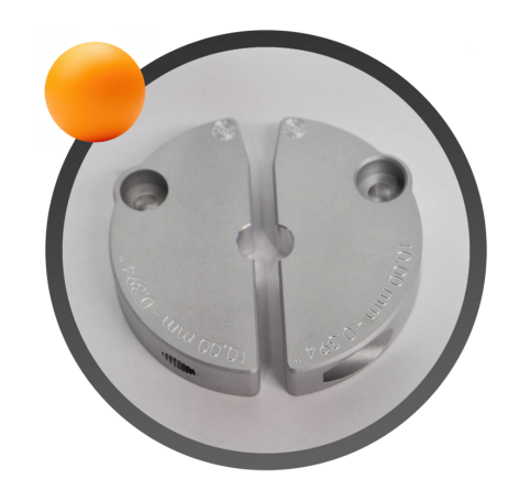
TF 1.6 Clamping collars