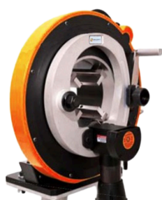
OTSM-2220 1500W optional