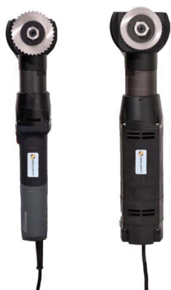
OTSM-1220 1300W standard

The OTS orbital pipe cutting machines are delivered in a wooden crate with a bottom fixation for transport and storage. The standard OTSM-1220 (1300W) saw motor with variable speed control comes in a separate plastic case, which fits inside the crate with the machine. A set of keys and an English manual are included.